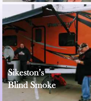
Sikeston's Blind Smoke