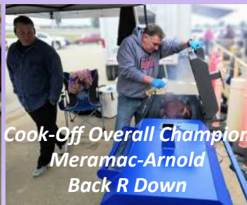
Cook-Off Overall Champion Meramac-Arnold Back R Down