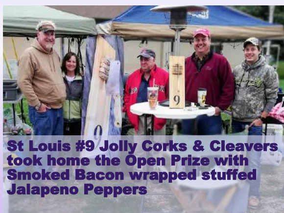
St Louis #9 Jolly Corks & Cleavers took home the Open Prize with Smoked Bacon wrapped stuffed Jalapeno Peppers