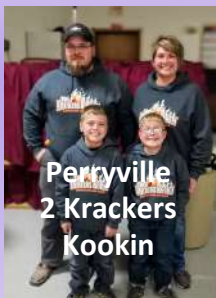
Perryville 2 Krackers Kookin