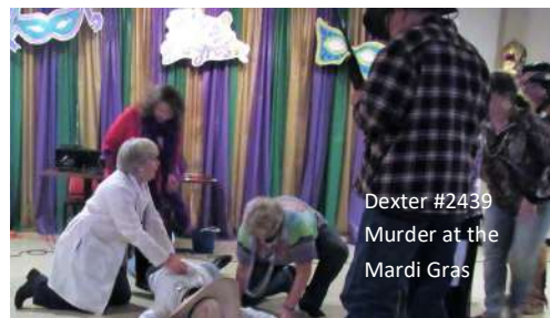
Dexter #2439 Murder at the Mardi Gras

Clinton #1034 held the lodge's PER night this February. With 18 PER's in attendance they initiated seven new members. It is awesome to have 18 PER's and even more so to have them show up for a meeting. Congratulations Clinton.