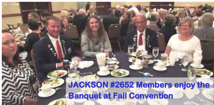
JACKSON #2652 Members enjoy the Banquet at Fall Convention