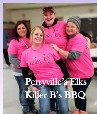
Perryville's Elks Killer B's BBQ