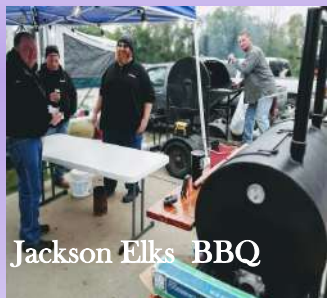
Jackson Elks BBQ

After a chilly October weekend the plans are to move the event up another 2 weeks. September 27-28 2019 Have your lodge team plan to some join us.