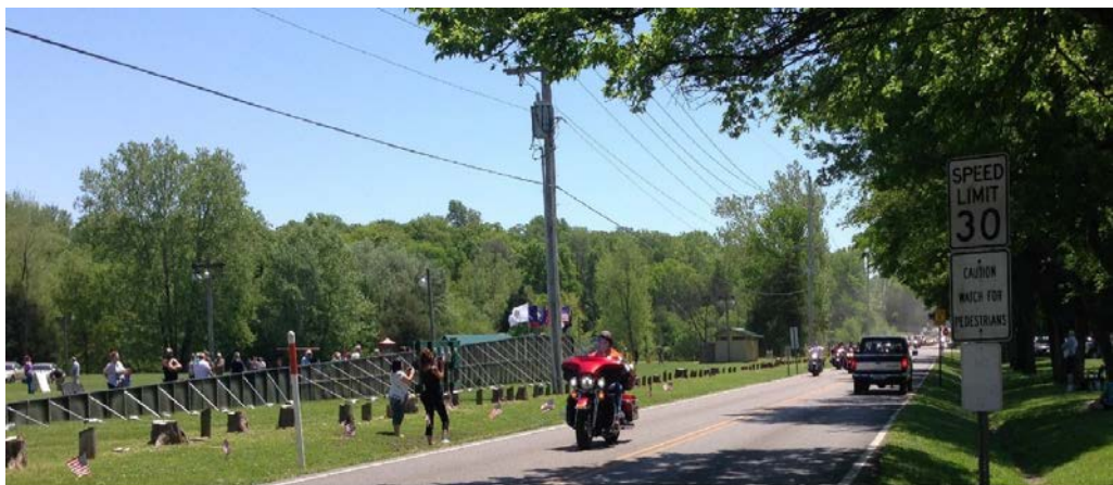
Nelson Scherrer of Festus-Crystal City #1721 leads the motorcycle parade for the Vietnam Wall.