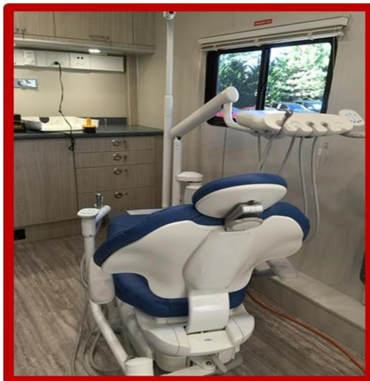
New Mobile Dental Van Interior

Online @ www.trumed.org View: TMC Lakewood Click On: Dental (Under Lakewood Services) Then: Read More