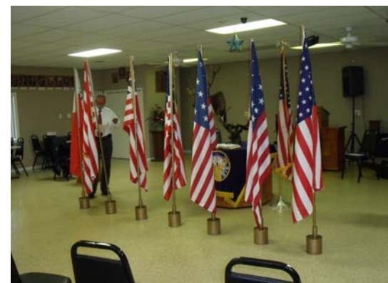
Setting up for Flag Day celebration

Benton County Elks Lodge 2783 participated in Warsaw Jubilee Days Parade by pulling the Missouri Elks drug trailer down Main Street.