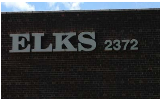
The East Central District celebrates FLAG DAY at the Meramec-Arnold Elks Lodge #2372