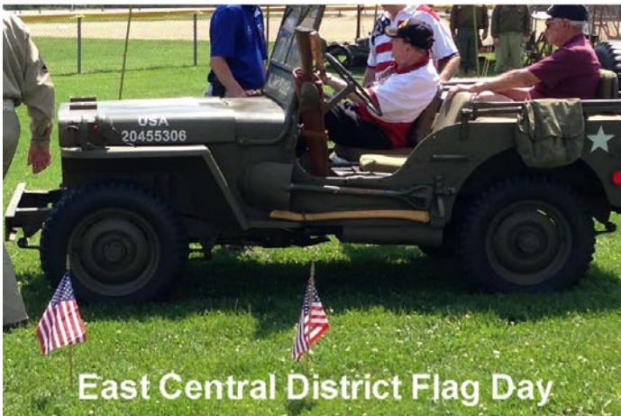
East Central District Flag Day