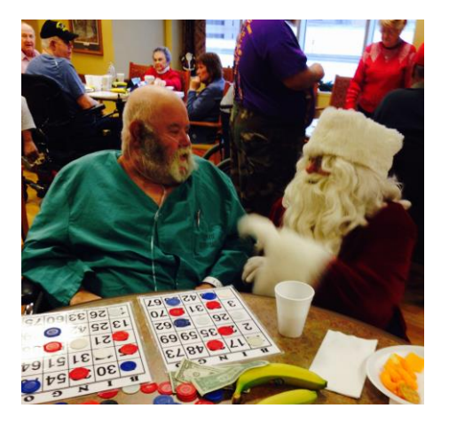
Santa enjoying time with veteran and getting a lesson in playing bingo.