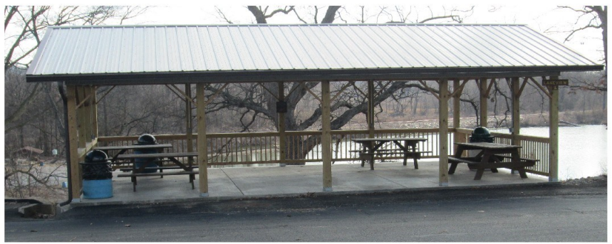
Elks Lodge #1721 made some much needed changes: we tore down an old building and built this new pavilion overlooking the lake.