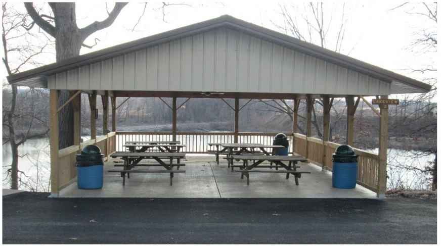
We also tore down our old "Caretakers Building" and replaced it with a second pavilion that overlooks the lake.